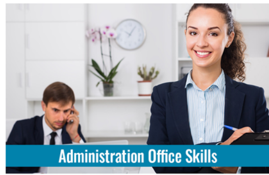
Administration Office Skills