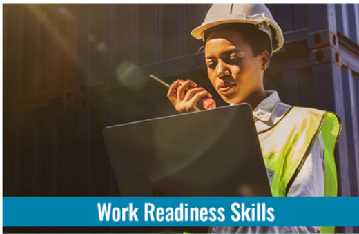
Work Readiness Skills