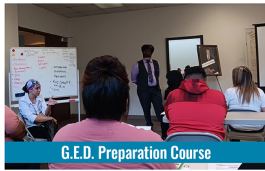
G.E.D. Preparation Course