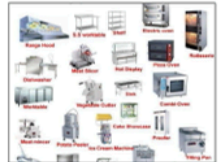
KITCHEN 101 Equipment & Lay Out