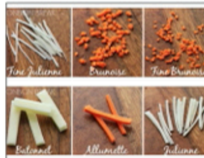
TECHNICAL SKILLS Basic Cuts & Techniques

Participants must be 16 years of age or older.