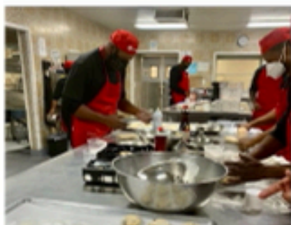
FOOD SAFETY & Sanitation