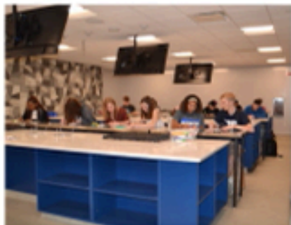
INGREDIENT IDENTIFICATION & Types Of Cuisine