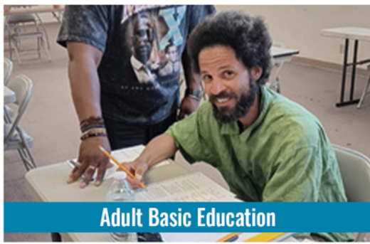
Adult Basic Education