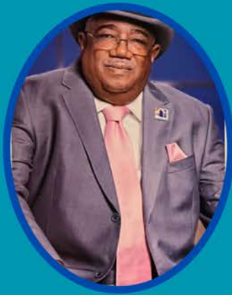
The Calvin C. Goode "Lifetime Achievement" Award