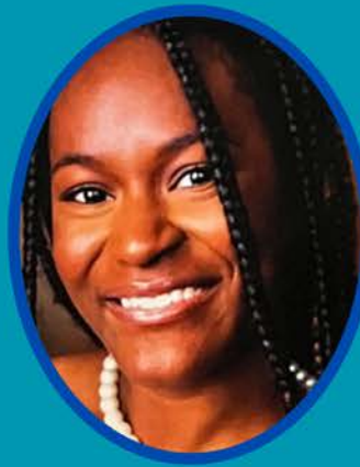
Dr. Gene Blue "Beacon" Awardees