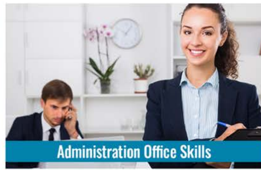
Administration Office Skills