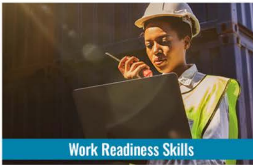
Work Readiness Skills