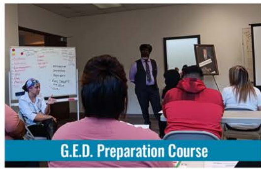
G.E.D. Preparation Course