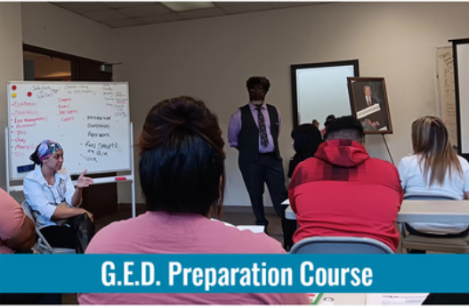
G.E.D. Preparation Course