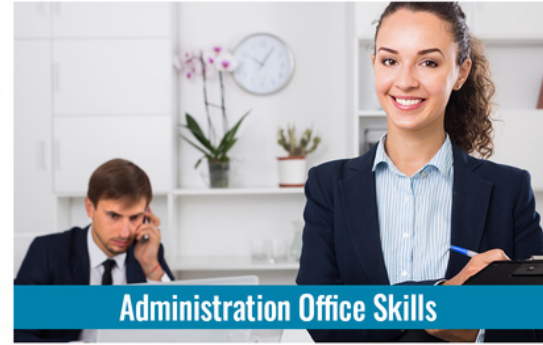
Administration Office Skills